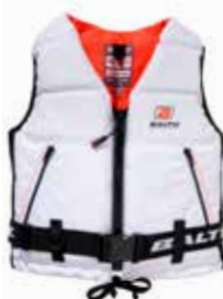
Super Soft II white art no 5855