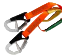
2-hook safety line art no 0108 Length 1 m