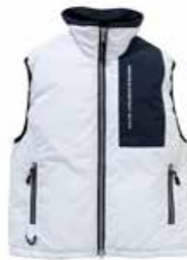
Sandhamn white art no 5776

Buoyancy aid in a design after a traditional down vest. Fleece-lined collar. Inner pocket and two outside zipped pockets. Approved according to the same standard as a buoyancy aid. Detachable crutch strap. Also available in women's size. Buoyancy 60N. Two years guarantee.