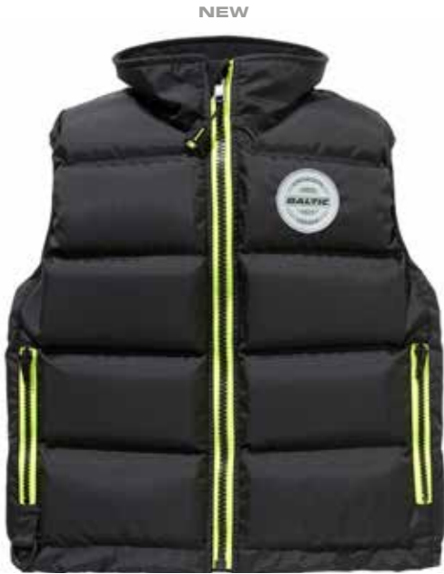
Surf & Turf Junior black art no 5370