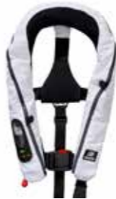
Legend 165 auto white art no 1748