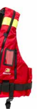
Hybrid 220 Pilot auto red art no 1731 Hybrid 220 Pilot man red art no 1721