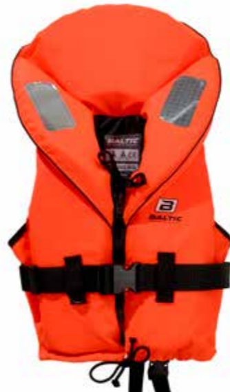
Skipper orange art no 1280