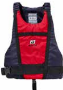
Paddler red/navy art no 5614