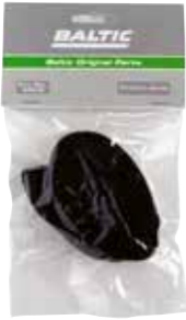
Crutch Strap kit Dinghy Pro 2511