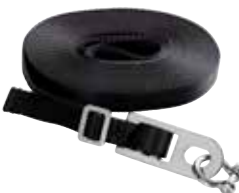
Jackstay art no 0101