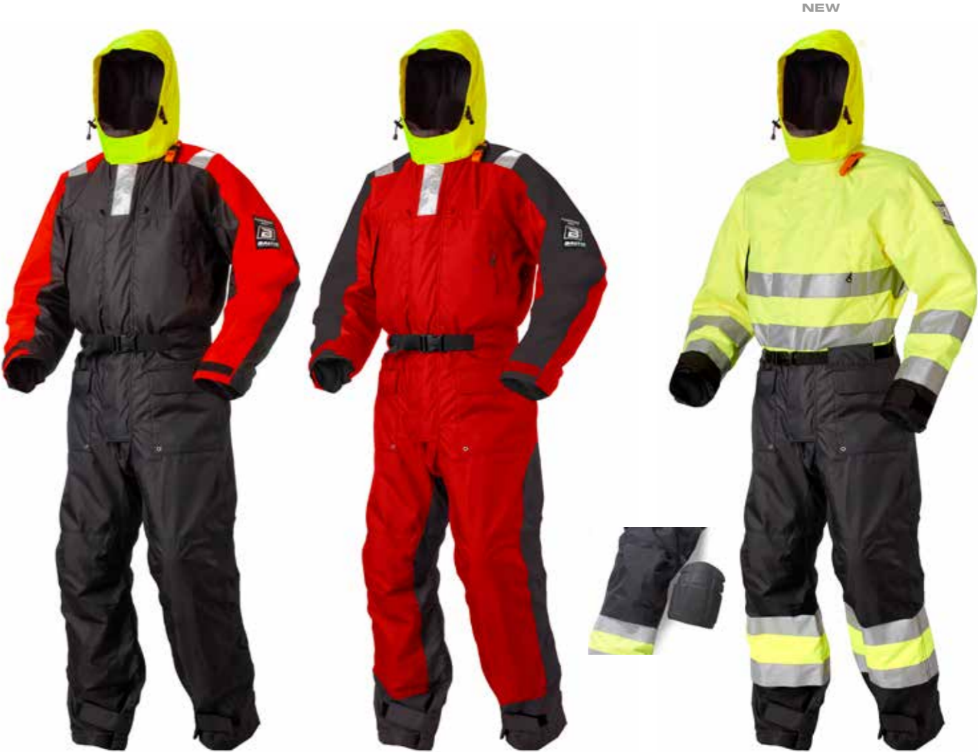
Amarok unisex black/red art no 5798 Child/Junior black/red art no 5799

Same design and sizes as Amarok but with pockets on the knees to add cushioning protection if required. Approved to high visibility workwear standard EN 20471. Two years guarantee.