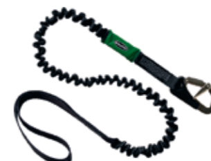
1-hook safety line elasticated art no 0109 Extended length 2 m