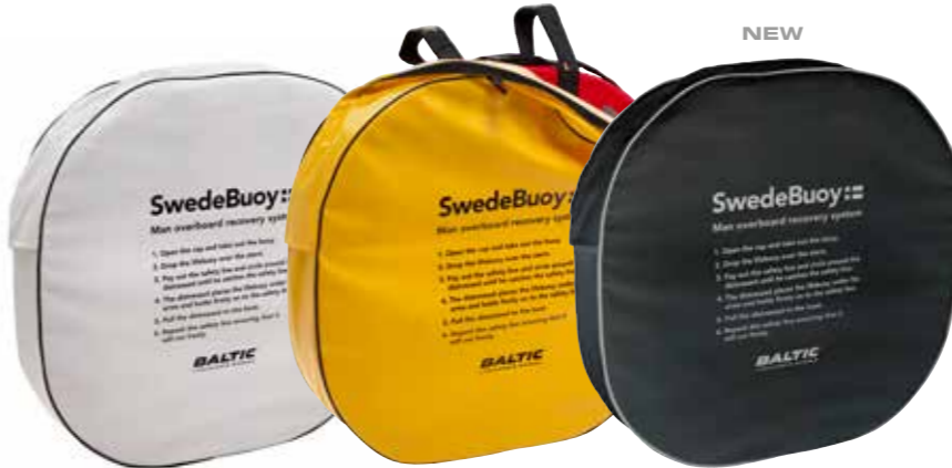
Swedebuoy man overboard recovery system white art no 9595 Spare cover white art no 9596

We have different models of lifebuoys for different purposes. Swedebuoy and Rescue Sling are stored to be released into the water and trawled around the distressed person who grabs the floating line. The crew can then pull the distressed to the boat and use the Swedebuoy/Rescue Sling to help them back on board. The horseshoe combination is for use in calmer environments, for example, in cases of overboard near land or in port.