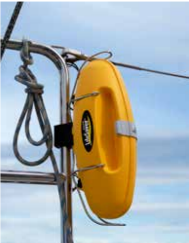
Baltic LifeSaver holder art no 8903

BALTIC LIFESAVER The Baltic Lifesaver is an automatically inflatable horseshoe buoy. The compact design and easy deployment makes it suitable for many applications afloat and ashore.