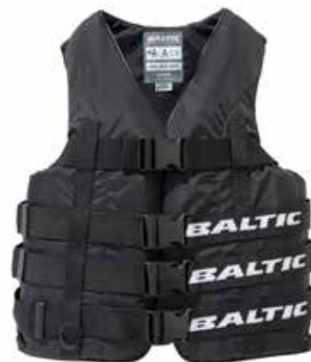
Waterski black art no 5531

Sizes: S 30-50, M 50-70, L 70-90, XL 90+ kg