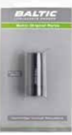
Cartridge United Moulders 2520