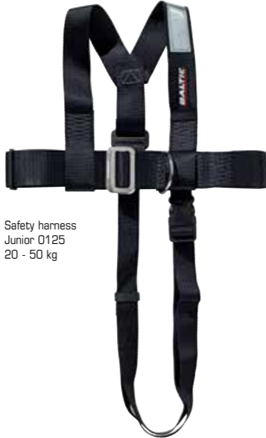
Safety harness Junior 0125 20 - 50 kg