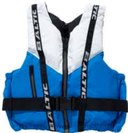
Genua white/turquoise art no 5823

Sizes: S 30-50, M 50-70, L 70-90, XL 90+ kg.