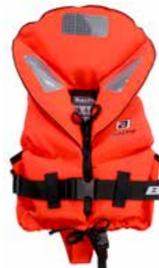
Pro Sailor orange art no 1284