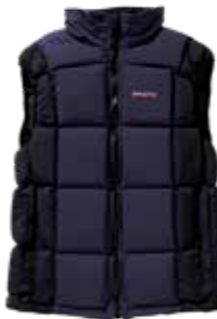
Surf & Turf Trend black/grey male art no 5567