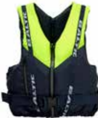
Genua UV yellow/navy art no 5821