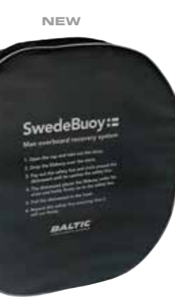
Swedebuoy man overboard recovery system black art no 9597 Spare cover black art no 9598