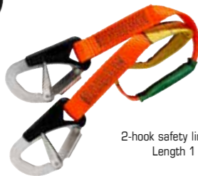
2-hook safety line 0108 Length 1 m