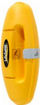
Baltic LifeSaver art no 8565

BALTIC LIFESAVER The Baltic Lifesaver is an automatically inflatable horseshoe buoy. The compact design and easy deployment makes it suitable for many applications afloat and ashore.