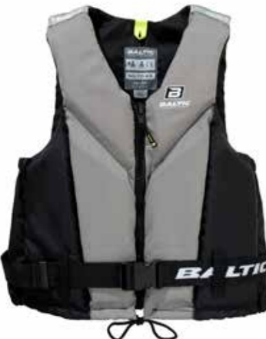
Trim grey/black art no 5840

Having the floatation material in multiple panels provides the Trim with a high degree of comfort and fit. Front zip fastening with waistband and bottom tie. Five years guarantee.