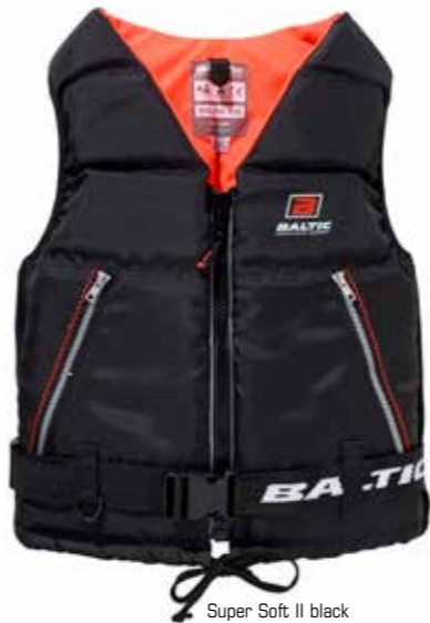
Super Soft II black art no 5853