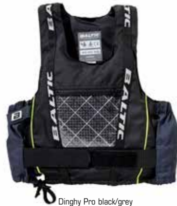
Dinghy Pro black/grey art no 5701

Sizes: XS 25-40, S 40-50, M 50-70, M/L 70-80, L 80-90, XL 90+ kg.