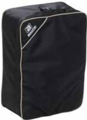
Baltic Rescue sling black art no 9607. Spare Cover Baltic Rescue sling black art no 9617.