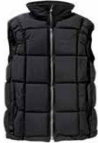
Surf & Turf black male art no 5564 Surf & Turf black female art no 5554