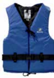
Aqua blue art no 5315