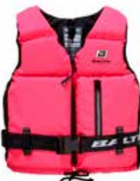
Mistral pink art no 5867