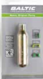
20 g cylinder with safety indicators 2420