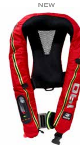
Legend 190 auto harness red art no 1971 Legend 190 SLA auto harness red art no 1976