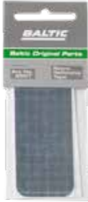
Retro reflective kit 2507