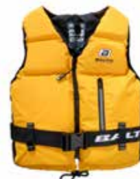
Mistral yellow art no 5868