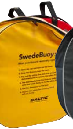
Swedebuoy man overboard recovery system yellow art no 9590 Spare cover yellow art no 9591