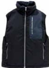
Sandhamn black art no 5775