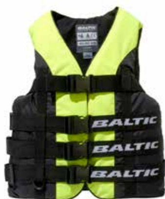
Waterski UV yellow/black art no 5532