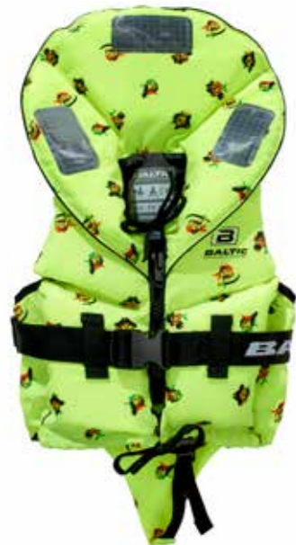
Pirate art no 1285