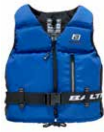
Mistral blue art no 5866