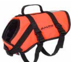
Pluto orange art no 0410