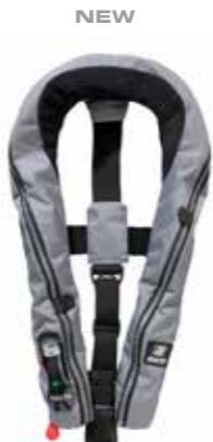
Compact 100 auto grey art no 1352