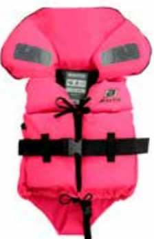
Split Front pink art no 1268 (3-15 kg) and 1269 (15-30 kg)