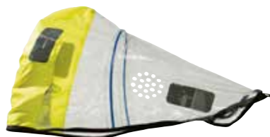
Sprayhood art no 2516

Life-light, or emergency light, which activates automatically upon immersion. The lifejacket light flashes intensively for at least 8 hours and is fitted with an on-off test button. M.E.D./SOLAS approved and is mandatory for World Sailing OSR.