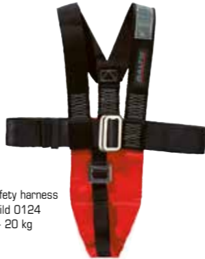
Safety harness Child 0124 3 - 20 kg