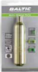
38 g cylinder with safety indicators 2438