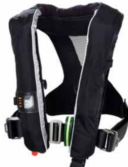
Race auto harness black art no 1780 Race auto SL harness black art no 1790

Our classic lifejacket. The waistband has two adjusters to provide optimum fit. The integrated safety harness has a woven loop to secure the lifeline and the crutch strap is detachable. Model SL is equipped with spray hood and emergency light and is therefore approved for World Sailing OSR. Buoyancy 165N. The inspection window is fitted so that you can visually check the two indicators of the automatic valve are showing green and that the lifejacket is ready for use. Five years guarantee.