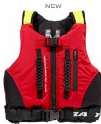
Stinger red/black art no 5734