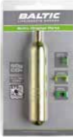
60 g cylinder with safety indicators 2460