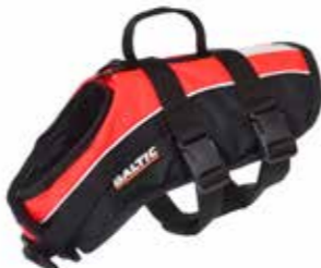
Mascot black/rozzo art no 0430