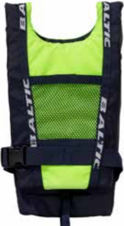
Canoe UV yellow/navy art no 5518