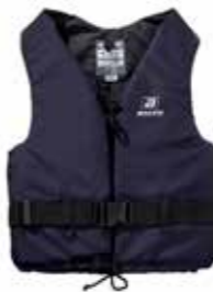
Aqua navy art no 5617

Sizes: S 30-50, M 50-70, L 70-90, XL 90+ kg.