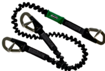
3-hook safety line elasticated 0106 Extended length 2 m