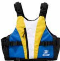
X3 blue/yellow/white art no 5123