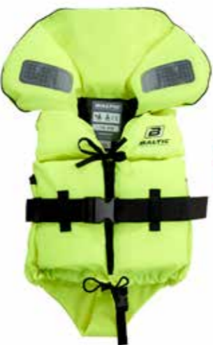
Split Front UV yellow art no 1266 (3-15 kg) and 1267 (15-30 kg)