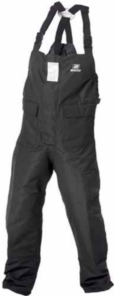
High Top Trousers black art no 5170