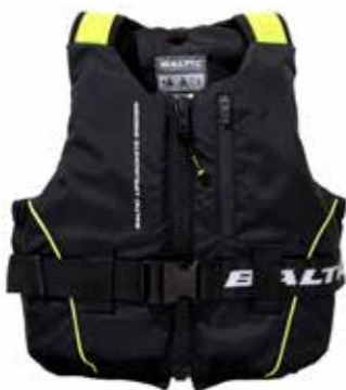
K2 black art no 5163

Sizes: S 30-50, M 50-70, L 70-90, XL 90+ kg