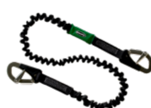
2-hook safety line elasticated art no 0107 Extended length 2 m