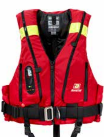
Hybrid 220 auto red art no 1711 Hybrid 220 man red art no 1701