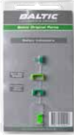
Safety indicators Suitable for all Baltic inflatable models 2404