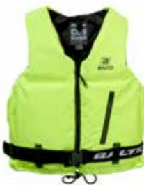
Axent UV yellow art no 5815