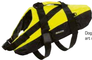
Dog vest Special UV yellow/black art no 0420

Sizes: S 0-8, M 8-15, L 15-40, XL 40+, XXL 40++ kg.