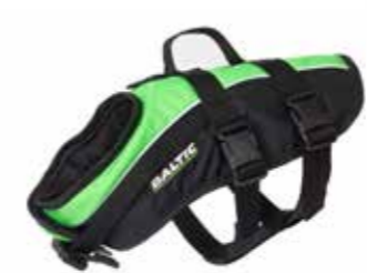
Mascot black/green art no 0431