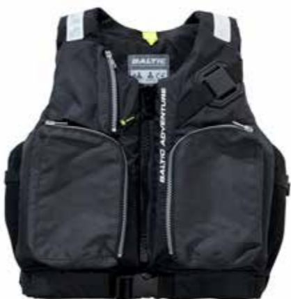
Adventure black art no 5350