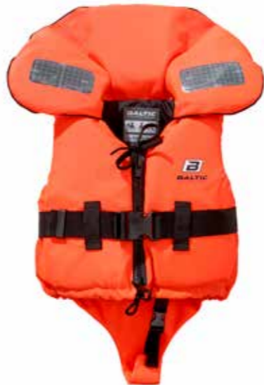
Baltic Original orange art no 1251

Sizes: toddler 3-10, toddler 10-20, child 15-30, child 30-40, junior 40-50, M 50-70, L 70-100, XL 100+ kg.