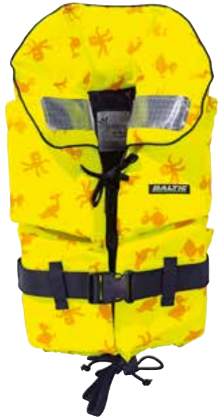
Print art no 1255