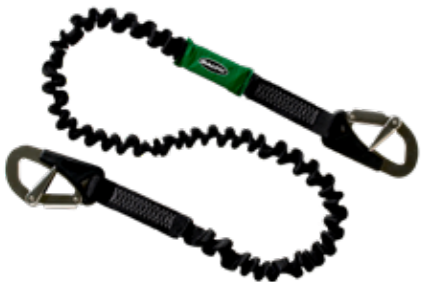
2-hook safety line elasticated 0107 Extended length 2 m