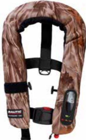
Flyfisher auto camo art no 1573 Flyfisher man camo art no 1572