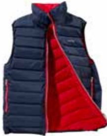
Flipper navy/red art no 6832