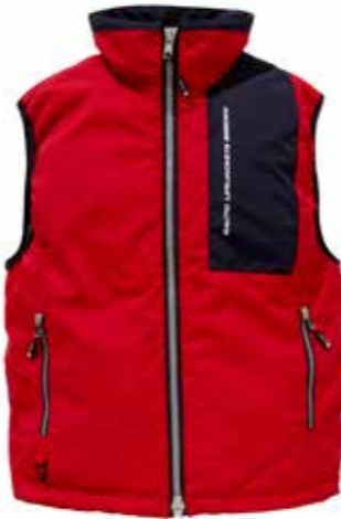
Sandhamn red art no 5777

Sizes: S 60-70, M 70-80, L 80-90, XL 90-100, XXL 100+ kg