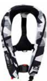
Legend 165 auto camo art no 1749