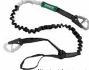
2-hook safety line elasticated with loop art no 0112 Extended length 2 m