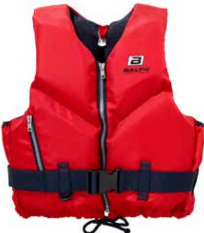
Mariner red art no 5637

The Mariner is based on our model Genua but with a slightly simplified design but keeps the split front panels. Zipped outside pocket. Front zip fastening with waistband and bottom tie. Five years guarantee.