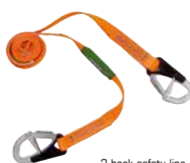
2-hook safety line art no 0115 Length 2 m