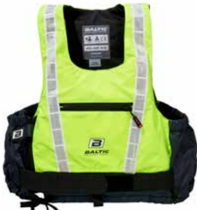
HI-VIS Pro UV yellow/grey art no 5720

Sizes: XS 25-40, S 40-50, M 50-70, M/L 70-80, L 80-90, XL 90+ kg.