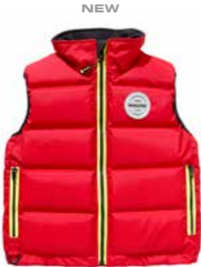
Surf & Turf Junior red art no 5371

Buoyancy aid in a design after a traditional down vest. Warm, practical and stylish. The Surf and Turf Junior is approved according to the same standard as a standard buoyancy aid. Features include two zip pockets and crutch strap. Suitable for swimmers only. Buoyancy 42N. Two years guarantee.