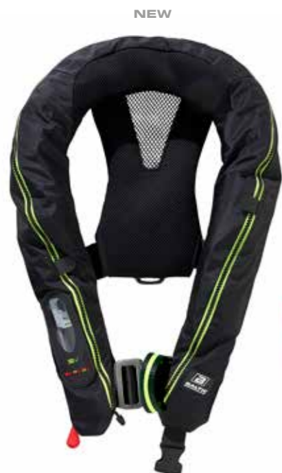
Legend 275 auto harness black art no 2870 Legend 275 auto harness SLA black art no 2875 Legend 275 man harness black art no 2860