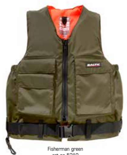
Fisherman green art no 5310

Sizes: S 30-50, M 50-70, L 70-90, XL 90+ kg.