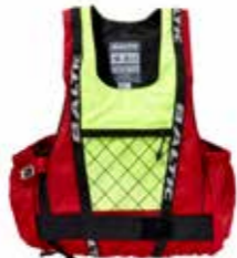
Dinghy Pro red/UV yellow art no 5707