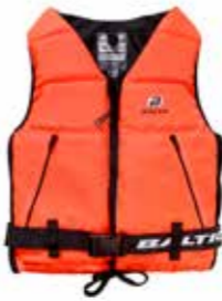
Super Soft II orange art no 5854