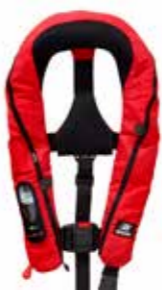
Legend 165 auto red art no 1746