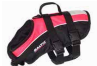
Mascot black/pink art no 0432