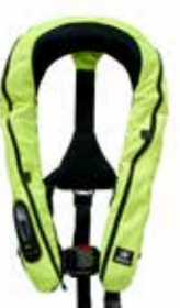
Legend 165 auto UV yellow art no 1744