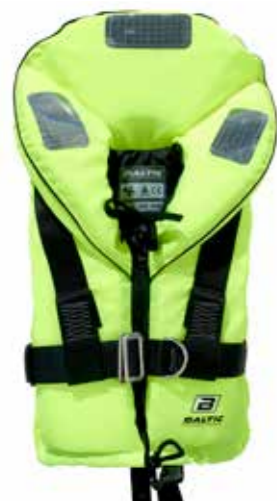
Ocean harness UV yellow art no 1299