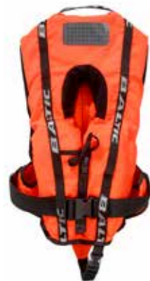
Bambi Supersoft orange art no 1252