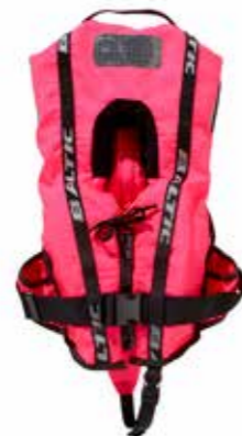
Bambi Supersoft pink art no 1264