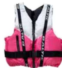
Genua white/pink art no 5822