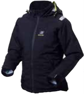
Top Float black art no 5885