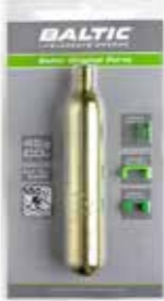
45 g cylinder with safety indicators 2445