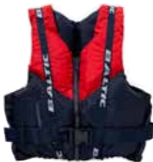
Genua red/navy art no 5826