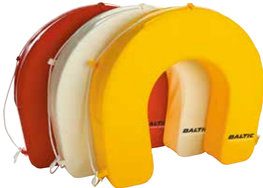
Horseshoe buoy red art no 8563, white art no 8560, yellow art no 8562 Spare cover red art no 9573, white art no 9570, yellow art no 9572