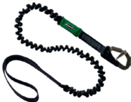
1-hook safety line elasticated 0109 Extended length 2 m