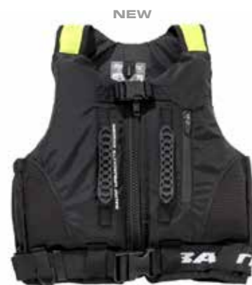
Stinger black art no 5733