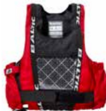
Dinghy Pro red/black art no 5702