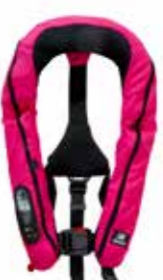
Legend 165 auto pink art no 1743