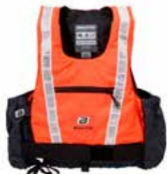
HI-VIS Pro UV orange/grey art no 5721