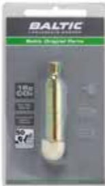
16 g cylinder with safety indicator 2416