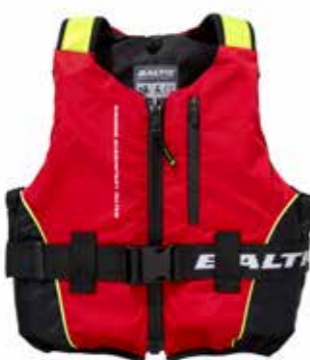
K2 red/black art no 5164