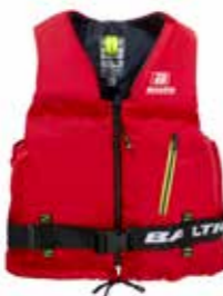
Axent red art no 5811