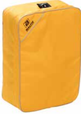
Baltic Rescue sling yellow art no 9606 Spare Cover Baltic Rescue sling yellow art no 9616