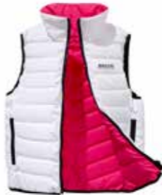
Flipper white/ pink art no 6831