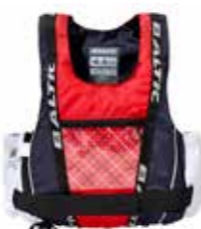
Dinghy Pro navy/red/white art no 5706