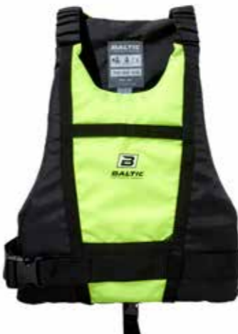
Paddler UV yellow/black art no 5613