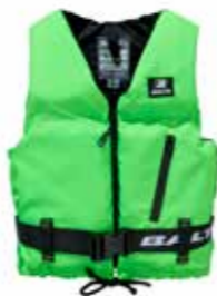
Axent green art no 5817