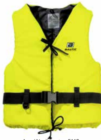
Aqua UV yellow art no 5116

An entry level general purpose buoyancy aid. Neck tie, waistband and bottom tie. Five years guarantee.