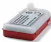
Lifejacket light M.E.D./SOLAS art no 2401