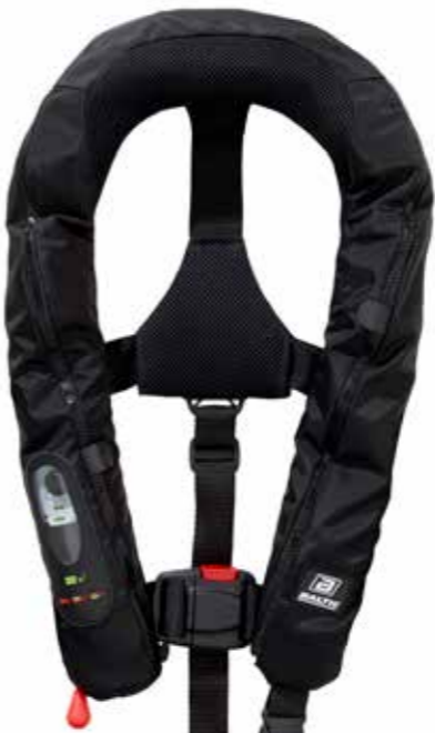
Legend 165 auto black art no 1745