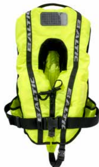
Bambi Supersoft UV yellow art no 1253