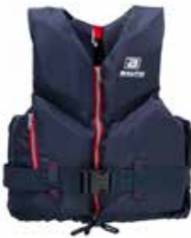
Mariner navy art no 5638

Sizes: S 30-50, M 50-70, L 70-90, XL 90+ kg.