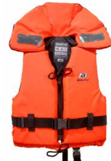
Baltic Original orange art no 1240