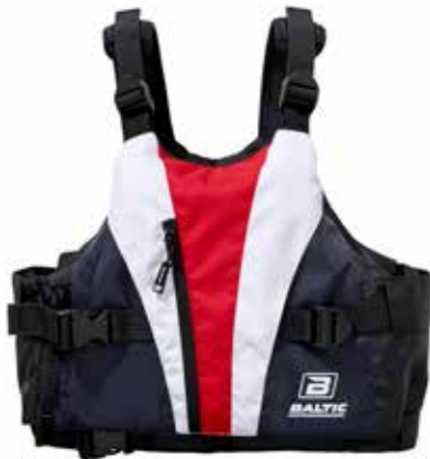
X3 red/white/navy art no 5122

Sizes: XS 25-40, S 40-50, M 50-70, L 70-90, XL 90+ kg.