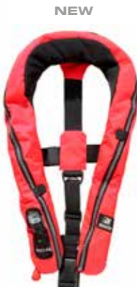
Compact 100 auto rosso art no 1351