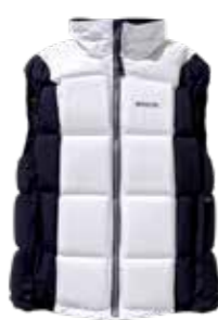
Surf & Turf white/navy male art no 5565 Surf & Turf white/navy female art no 5555