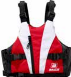
X3 red/white/black art no 5124