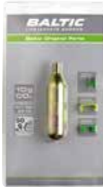
10 g cylinder with safety indicators 2410