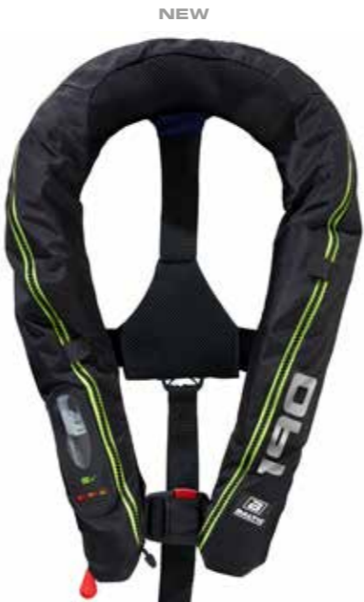
Legend 190 auto black art no 1990