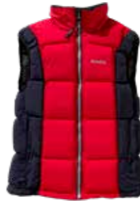
Surf & Turf red/navy male art no 5668 Surf & Turf red/navy female art no 5658