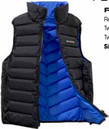
Flipper black/blue art no 6830

Sizes: XS 50-60, S 60-70, M 70-80, L 80-90, XL 90-100, XXL 100+ kg