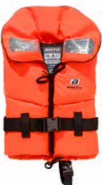
Split Front orange art no 1254 (3-15 kg) and 1244 (15-30 kg)