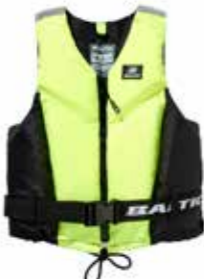
Trim UV yellow/black art no 5844

Sizes: S 30-50, M 50-70, L 70-90, XL 90+ kg.