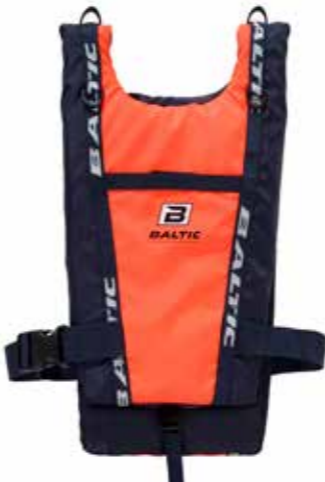
Canoe Hydro orange/navy art no 5600