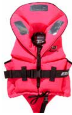
Pro Sailor pink art no 1289