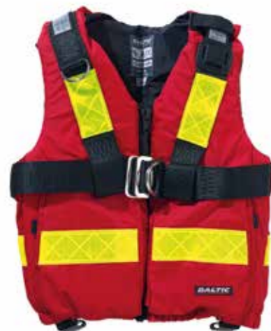
Pilot red art no 5513