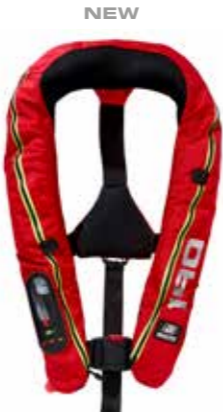
Legend 190 auto red art no 1991