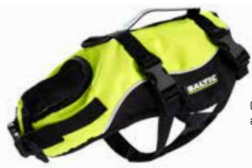
Cat vest Maja UV yellow/black art no 0473