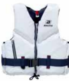
Mariner white art no 5639