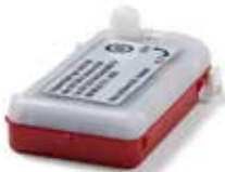
Lifejacket light M.E.D./SOLAS 2401