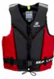
Trim red/black art no 5843