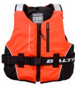
K2 orange/black art no 5165