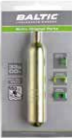
33 g cylinder with safety indicators 2433