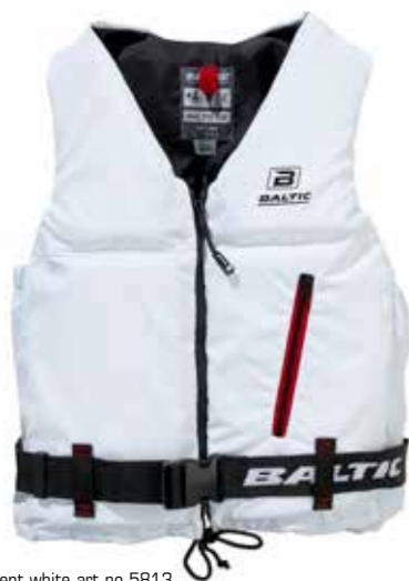
Axent white art no 5813

Axent is a slightly longer buoyancy aid with separate front panels. With outside zip pocket. Front zip fastening with waistband and bottom tie. Five years guarantee.