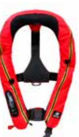
Legend 165 auto rosso art no 1742