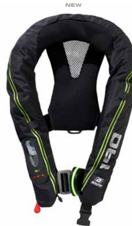
Legend 190 auto harness black art no 1970 Legend 190 SLA auto harness black art no 1975