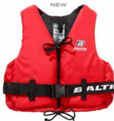
Aqua Pro red art no 5801

Comfortable all-round buoyancy aid. The Aqua Pro has a front zip fastening with waistband, bottom and top tie. Five years guarantee.