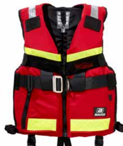
SAR red art no 5516