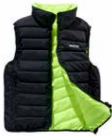
Flipper black/UV yellow art no 6833

Buoyancy aid in a classic gilet style. Two zipped outer pockets and an inner pocket. Approved according to the same standard as a buoyancy aid. Detachable crutch strap and microfleece collar. Buoyancy 60N. Two years guarantee.