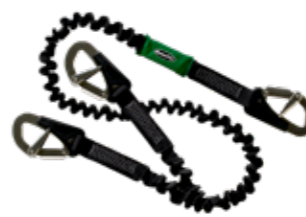
3-hook safety line elasticated art no 0106 Extended length 2 m