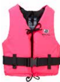
Aqua pink art no 5620