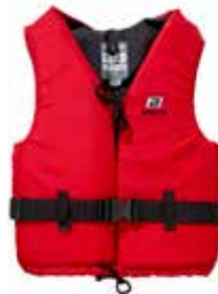
Aqua red art no 5319