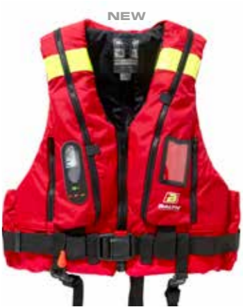
Hybrid 220 Pilot auto black art no 1730 Hybrid 220 Pilot man black art no 1720