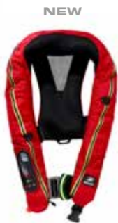
Legend 275 auto harness red art no 2871 Legend 275 auto harness SLA red art no 2876 Legend 275 man harness red art no 2861