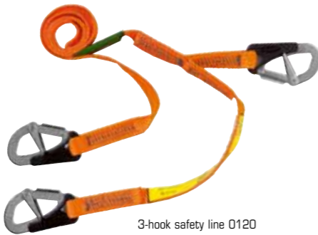
3-hook safety line 0120 Length 2 m