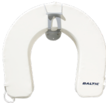
Baltic Horseshoe buoy holder art no 8902