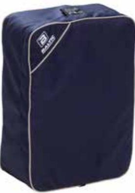
Baltic Rescue sling navy art no 9605. Spare Cover Baltic Rescue sling navy art no 9615.