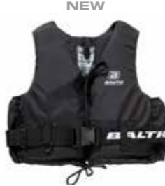
Aqua Pro black art no 5802

Sizes: S 30-50, M 50-70, L 70-90, XL 90+ kg.