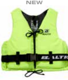
Aqua Pro UV yellow art no 5803