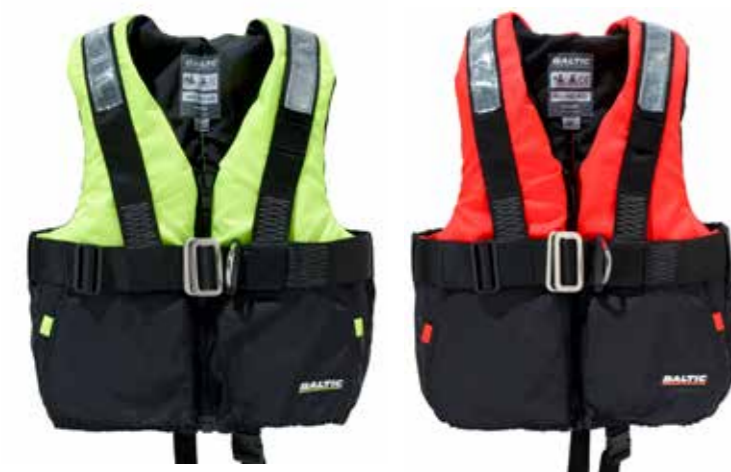
Offshore UV yellow/black art no 5110