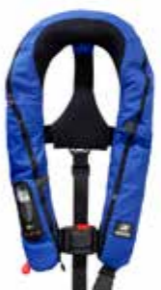
Legend 165 auto royal art no 1747