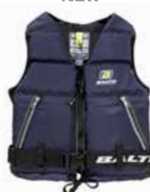
Super Soft II navy art no 5856