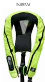
Legend 165 auto harness UV yellow art no 1784 Legend 165 auto harness SLA UV yellow art no 1794