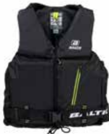
Axent black art no 5814

Sizes: S 30-50, M 50-70, L 70-90, XL 90+ kg.