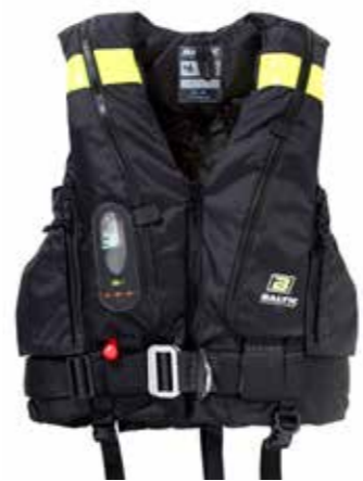
Hybrid 220 auto black art no 1710 Hybrid 220 man black art no 1700