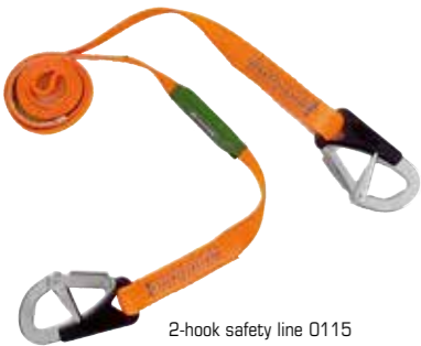
2-hook safety line 0115 Length 2 m