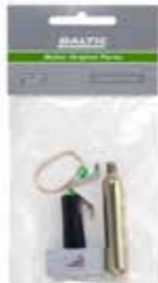
Baltic LifeSaver Rearming kit 2565