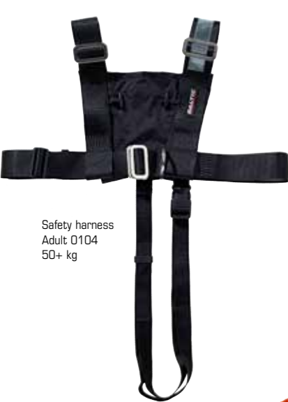
Safety harness Adult 0104 50+ kg

All of our safety lines and harnesses are approved in accordance with EN/ISO 12401 and comply to the regulations of World Sailing OSR. The harnesses webbings are made from UV-stabilized polyester. The safety lines are manufacture from polyamide webbing. The fittings are made of non-magnetic stainless steel. Five years guarantee.