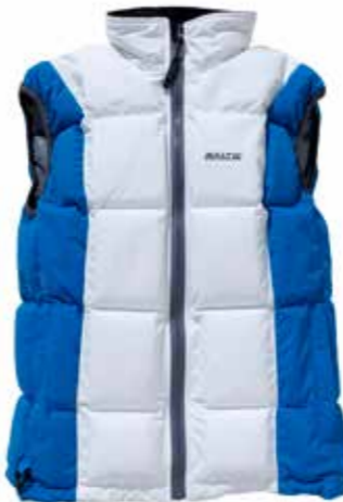
Surf & Turf Trend white/turquoise female art no 5659

Size female: S 50-60, M 60-70, L 70-80, XL 80-90 kg