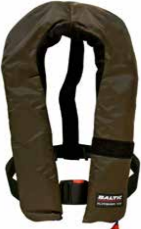
Flyfisher auto green art no 1583 Flyfisher man green art no 1582

Sizes: S 30-50, M 50-70, L 70-90, XL 90+ kg.