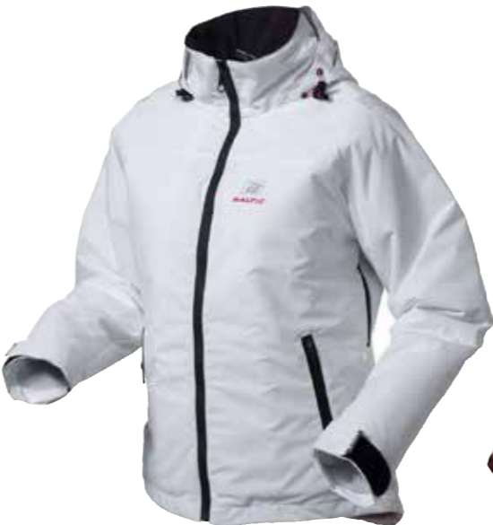
Top Float white art no 5886

Slim and smooth buoyant jacket with two outer zipped pockets. Fleece-lined collar. Adjustable hood. Inner pocket and detachable crutch strap. Ventilation zips under the arms for cooling in warm conditions. Approved according to the same standard as a buoyancy aid. Buoyancy 60N. Two years guarantee.