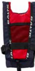
Canoe red/navy art no 5517