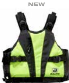
X3 UV yellow/black art no 5125