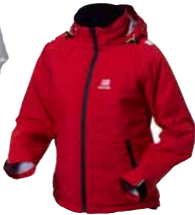
Top Float red art no 5887