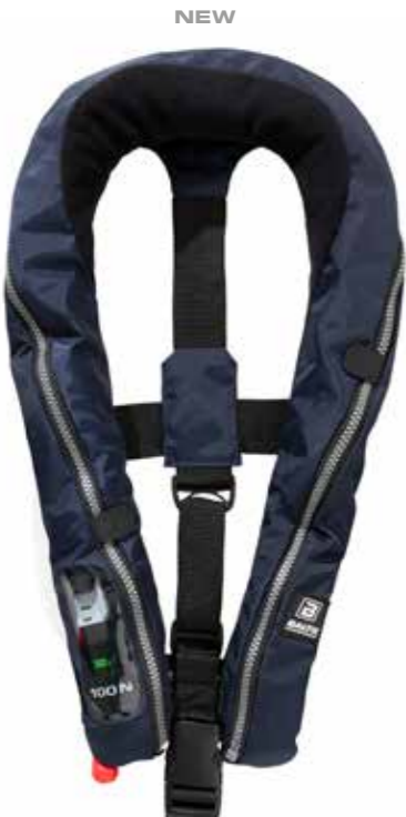
Compact 100 auto navy art no 1350