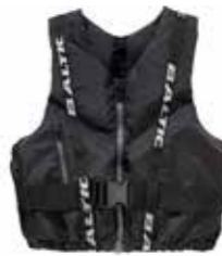
Genua black art no 5825