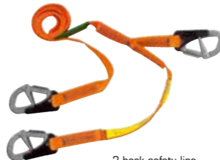
3-hook safety line art no 0120 Length 2 m