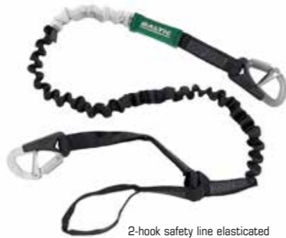
2-hook safety line elasticated with loop 0112 Extended length 2 m