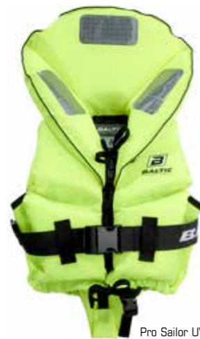
Pro Sailor UV yellow art no 1287

Sizes: toddler 3-15, child 15-30, junior 30-40 kg.