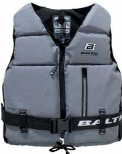
Mistral grey art no 5865

Sizes: XS 25-40, S 40-50, M 50-70, L 70-90, XL 90+ kg.